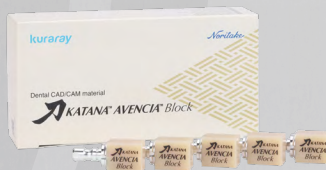
KATANA™ AVENCIA™ Blocks 12 (5pcs)