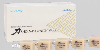
KATANA™ AVENCIA™ Blocks 14L (5pcs)