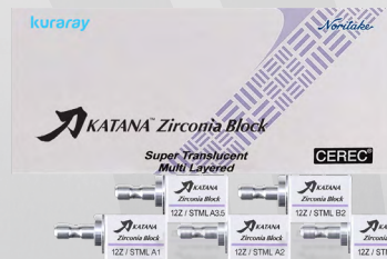
KATANA™ Zirconia Blocks 12Z/14Z (5pcs)