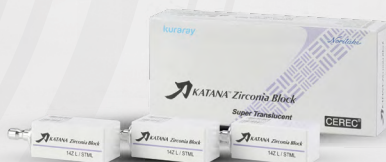
KATANA™ Zirconia Bridge Blocks 14Z L (3pcs)