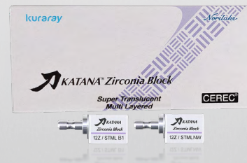
KATANA™ Zirconia Blocks 12Z/14Z (2pcs)