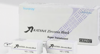
KATANA™ Zirconia Bridge Blocks 14Z L (2pcs)